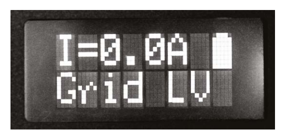
Operation in low-voltage mode - the display reads the value of the measured current flowing through the clamp and indicates the battery charge state