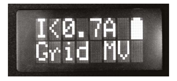
Operation in medium-voltage mode - the display reads the value of the set alarm threshold and indicates the battery charge status